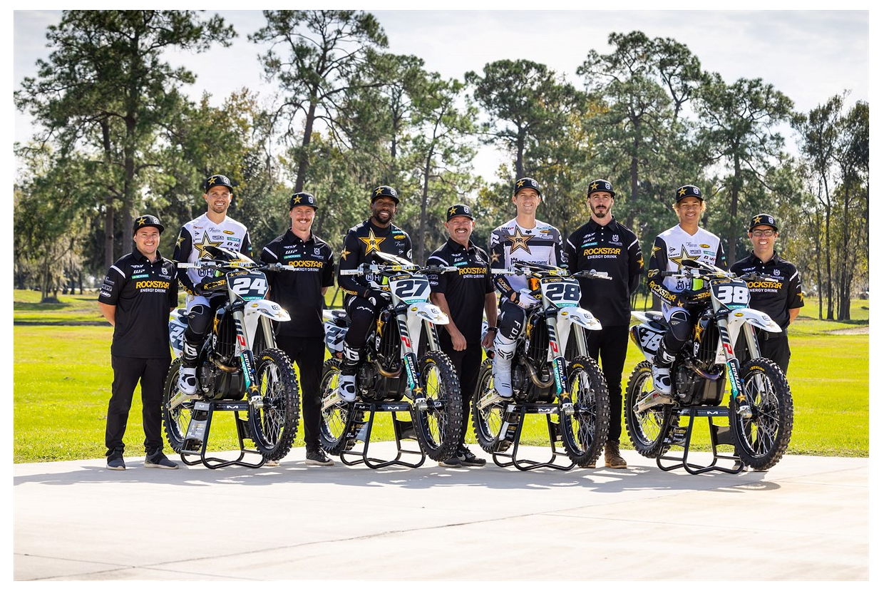
Rockstar Energy Husqvarna Factory Racing team 2023

STEWART AND CRAIG HIGHLIGHT 450 CLASS ROSTER; HAMPSHIRE AND SWOLL BACK FOR 2023